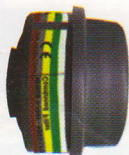
VENUS ABEK1P3R Filter Colour : Multicolour