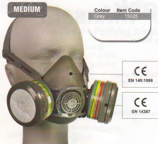
VENUS V-800 Half Mask