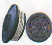
VENUS P3R HEPA Filter Colour : White