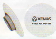
VENUS P3R PANCAKE FILTER Colour : White