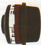
VENUS A1P3R Filter Colour : Brown